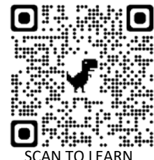
SCAN TO LEARN MORE ABOUT OTC PROCEDURES

This is a new service! Review all submittal requirements online (scan the QR code to the right!) and prepare all required paper documents for submittal in person at your appointment time. Schedule an over-the-counter submittal appointment online. Show up promptly to your appointment, with all required application materials. Pay all required fees at the time of appointment. Permit will be issued same-day if complete documentation provided at appointment.