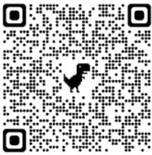
SCAN TO BOOK AN APPOINTMENT

This is a new service! Review all submittal requirements online (scan the QR code to the right!) and prepare all required paper documents for submittal in person at your appointment time. Schedule an over-the-counter submittal appointment online. Show up promptly to your appointment, with all required application materials. Pay all required fees at the time of appointment. Permit will be issued same-day if complete documentation provided at appointment.