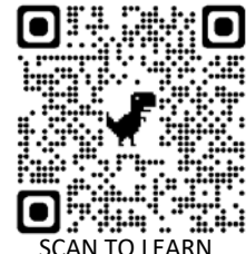
SCAN TO LEARN MORE ABOUT OTC PROCEDURES

This is a new service! Review all submittal requirements online (scan the QR code to the right!) and prepare all required paper documents for submittal in person at your appointment time. Schedule an over-the-counter submittal appointment online. Show up promptly to your appointment, with all required application materials. Pay all required fees at the time of appointment. Permit will be issued same-day if complete documentation provided at appointment.